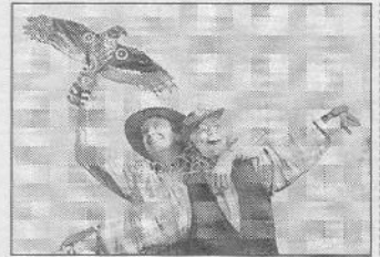
“Your new Hawk Bird Scarer replaces the old fashioned Scare-Crow”

Other uses: Stops Pigeons, Swallows and Seagulls roosting on boats, sheds, verandahs and roofs. Scares ducks off dams & swimming pools. But does not give 100% results for Sparrows.